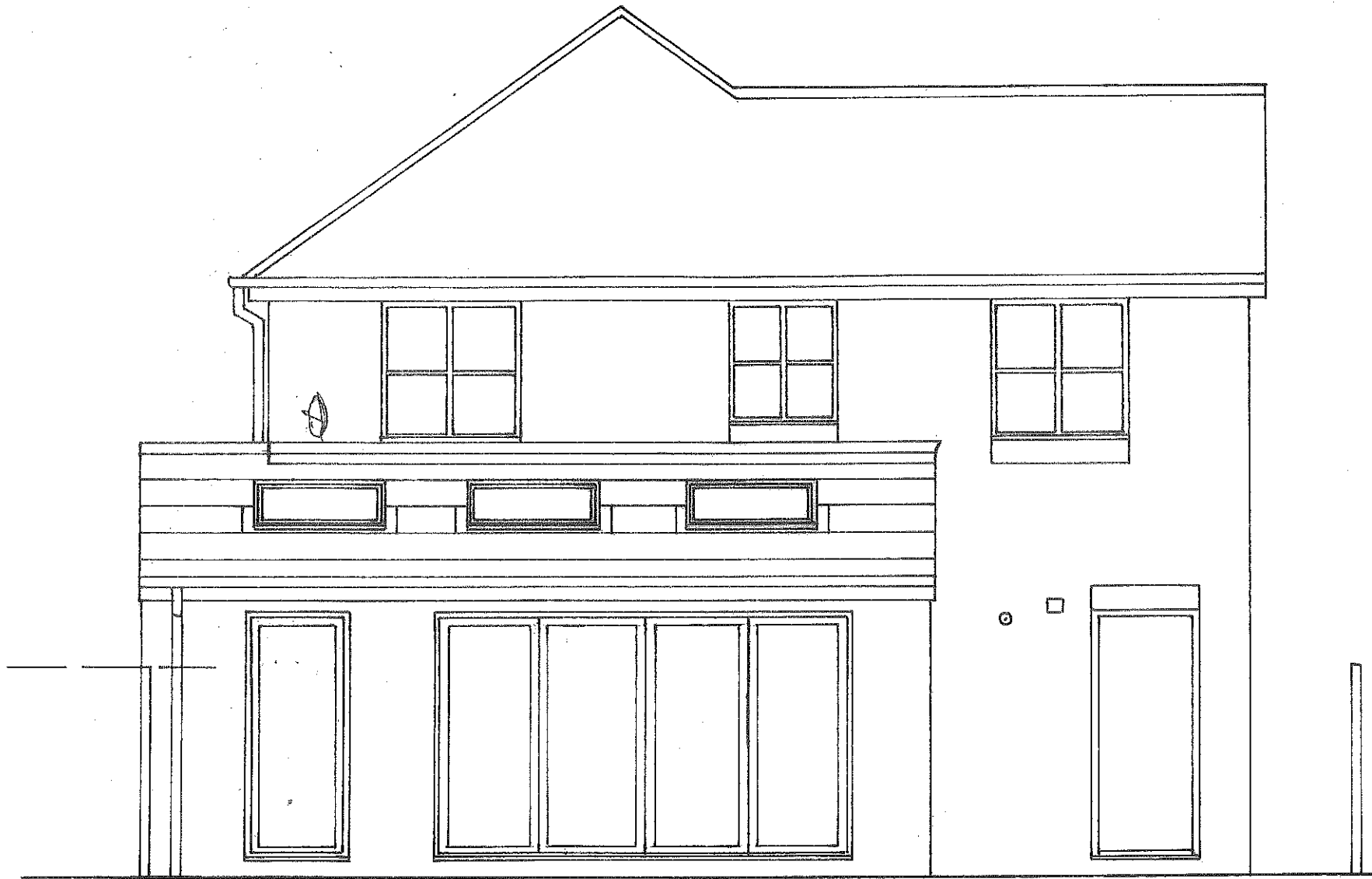
PROPOSED REAR 1:50

TILING COLOUR, DRY VEDGE, FACING BRICK, ETC. TO MATCH EXISTING, AS CLOSELY AS POSSIBLE. GREY DOOR FRAMING.